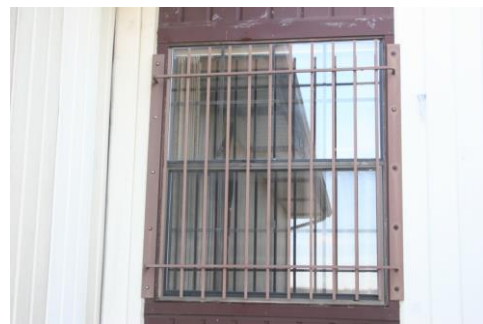
Window in hallway with exterior bars

There is located in the addition a strange arrangement of two small rooms with bars at the top and obvious places for the jail doors on each of the small rooms. The area has a very strong and heavy door leading from the hallway to the two cells. There is a small opening that serves as a pass-through the wall that looked to me only