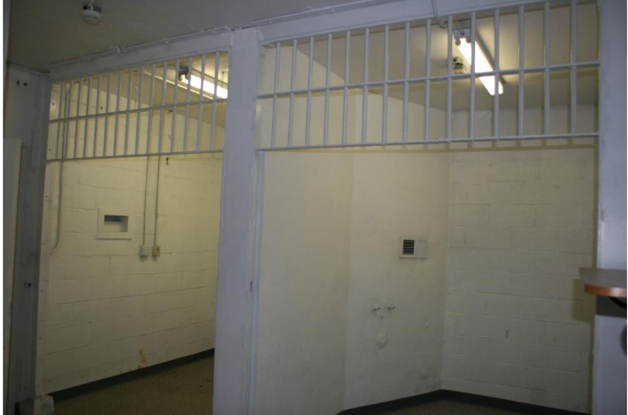
Jail cells obviously modified after the communications center was no longer used

suitable for passing mail or small items such as books or newspapers. It was in the wall between the hallway and the first cell. There was no way for such a pass through to the second cell.